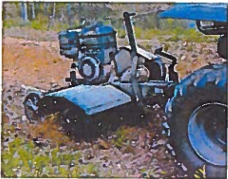
Tilling for small, medium, and large areas