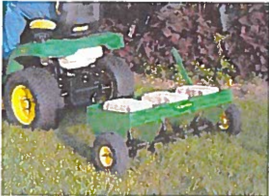
Aeration and Fall Fertilization